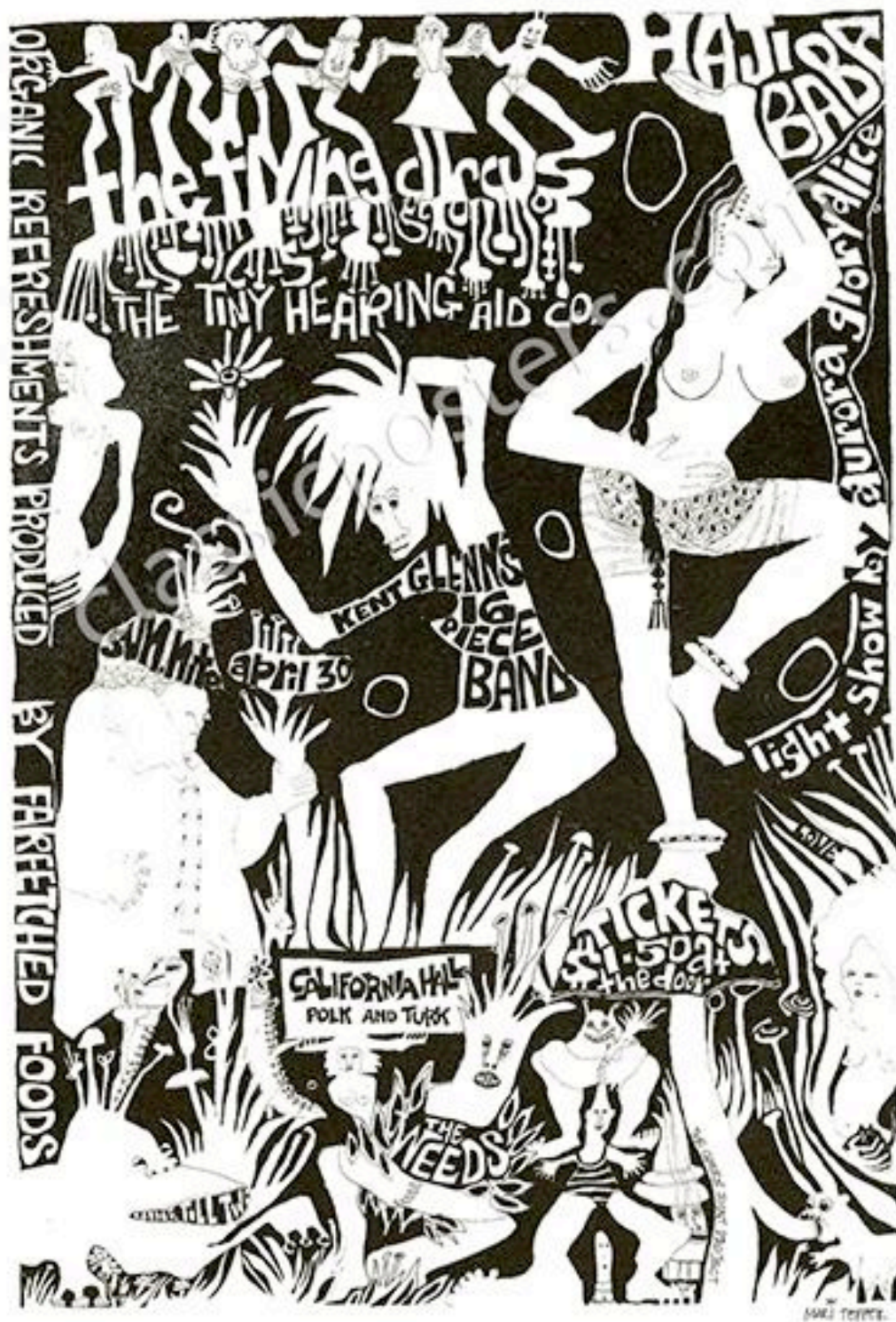
Fig. 3. Tepper, Mari, The Flying Circus , 1967, Offset Lithograph