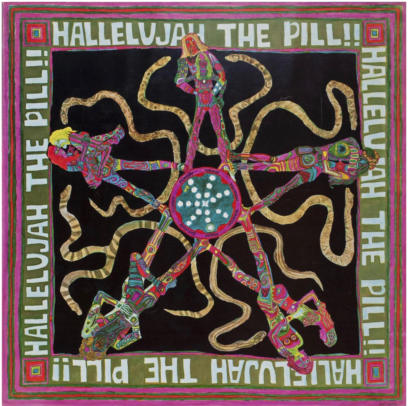
Fig. 1. Tepper, Mari. Hallelujah the Pill!! , 1967, Offset Lithograph