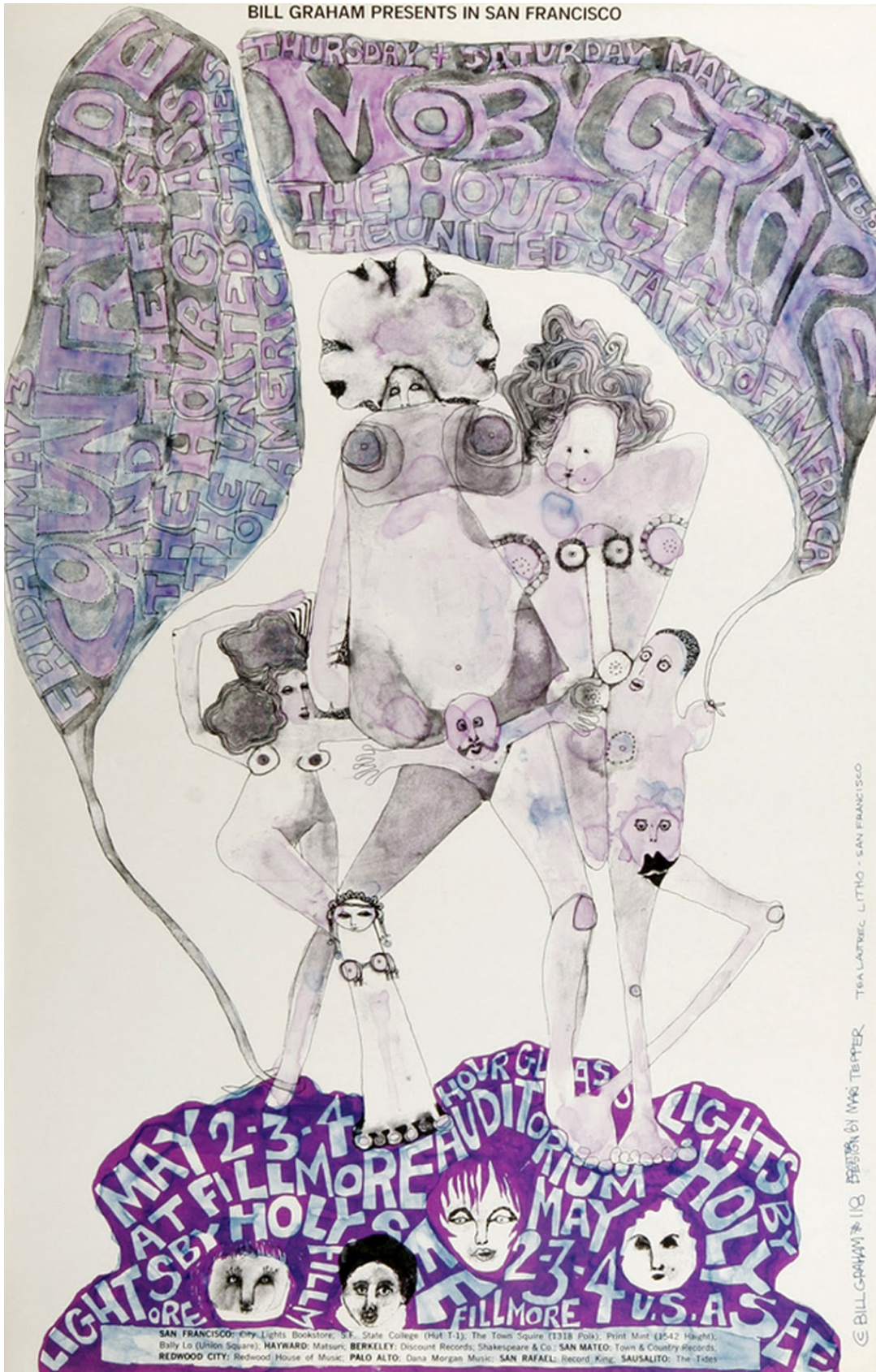
Fig. 5. Tepper, Mari, Moby Grape , 1968, Offset Lithograph