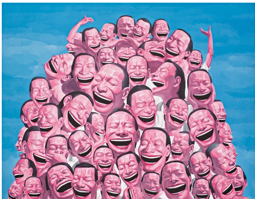
Figure 2. Yue Minjun, Garbage Hill , 2003, Acrylic on canvas, 198.9 x 278.5 cm