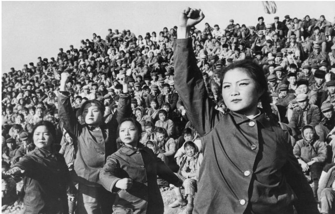
Figure 4. Red Guards