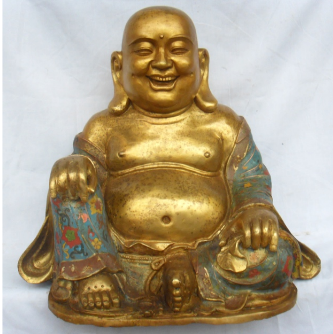
Figure 5. The laughing Buddha