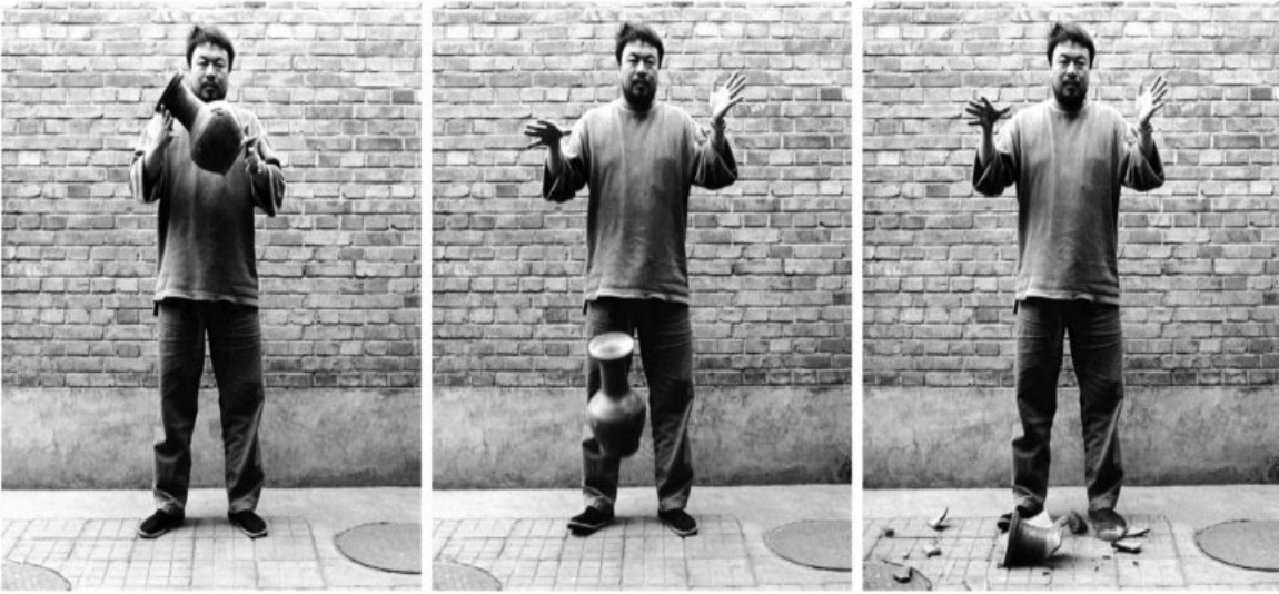
Figure 7. Ai Weiwei, Dropping a Han Dynasty Urn , 1995, Gelatin silver prints, each print is 136 x 109 cm