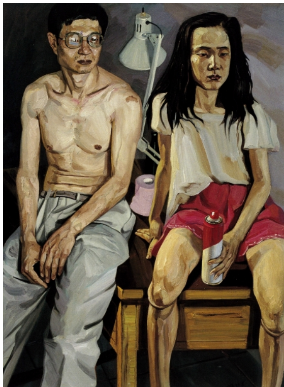
Figure 1. Liu Xiaodong, Midsummer , 1989, Oil on canvas, 130.58 × 99.4 cm