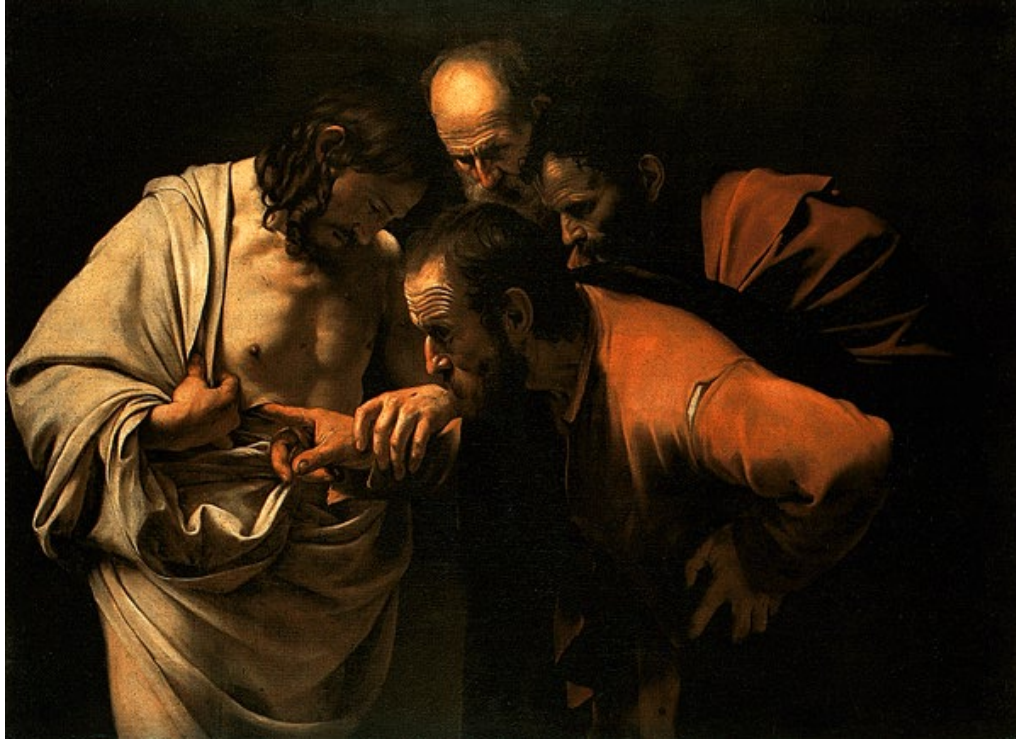
Figure 9. Michelangelo Merisi da Caravaggio, The Incredulity of Saint Thomas , 1601–02, Oil on canvas, 99 x 125 cm