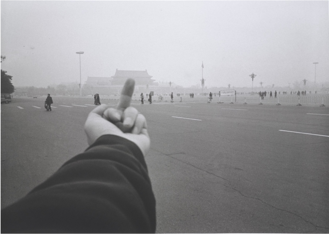
Figure 8. Ai Weiwei, Study Perspective-Tiananmen Square , 1998, Gelatin silver print, 38.9 x 59 cm