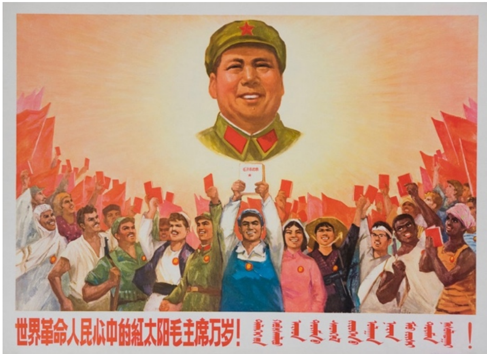
Figure 6. Unknown artist, Cultural Revolution poster