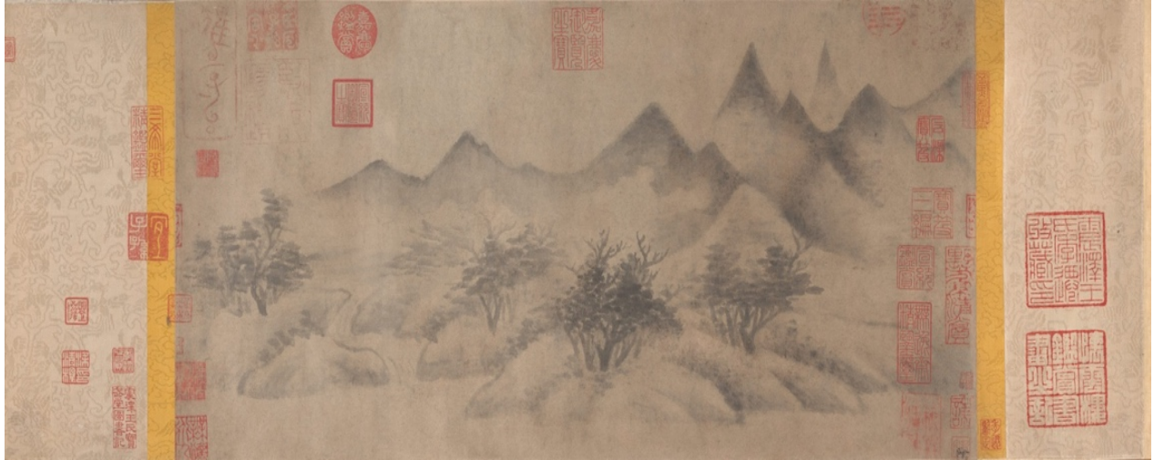
Figure 3. Mi Youren, Cloudy Mountains , Southern Song dynasty, 1127-1279, Ink on paper, 27.6 x 57 cm