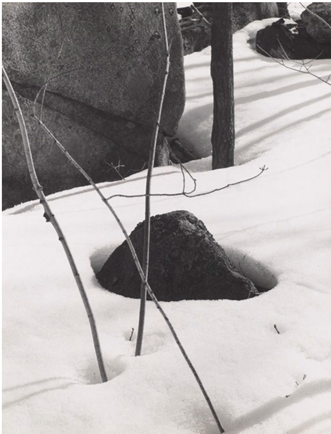
Figure 1. Minor White, Gloucester, Massachusetts , 1967