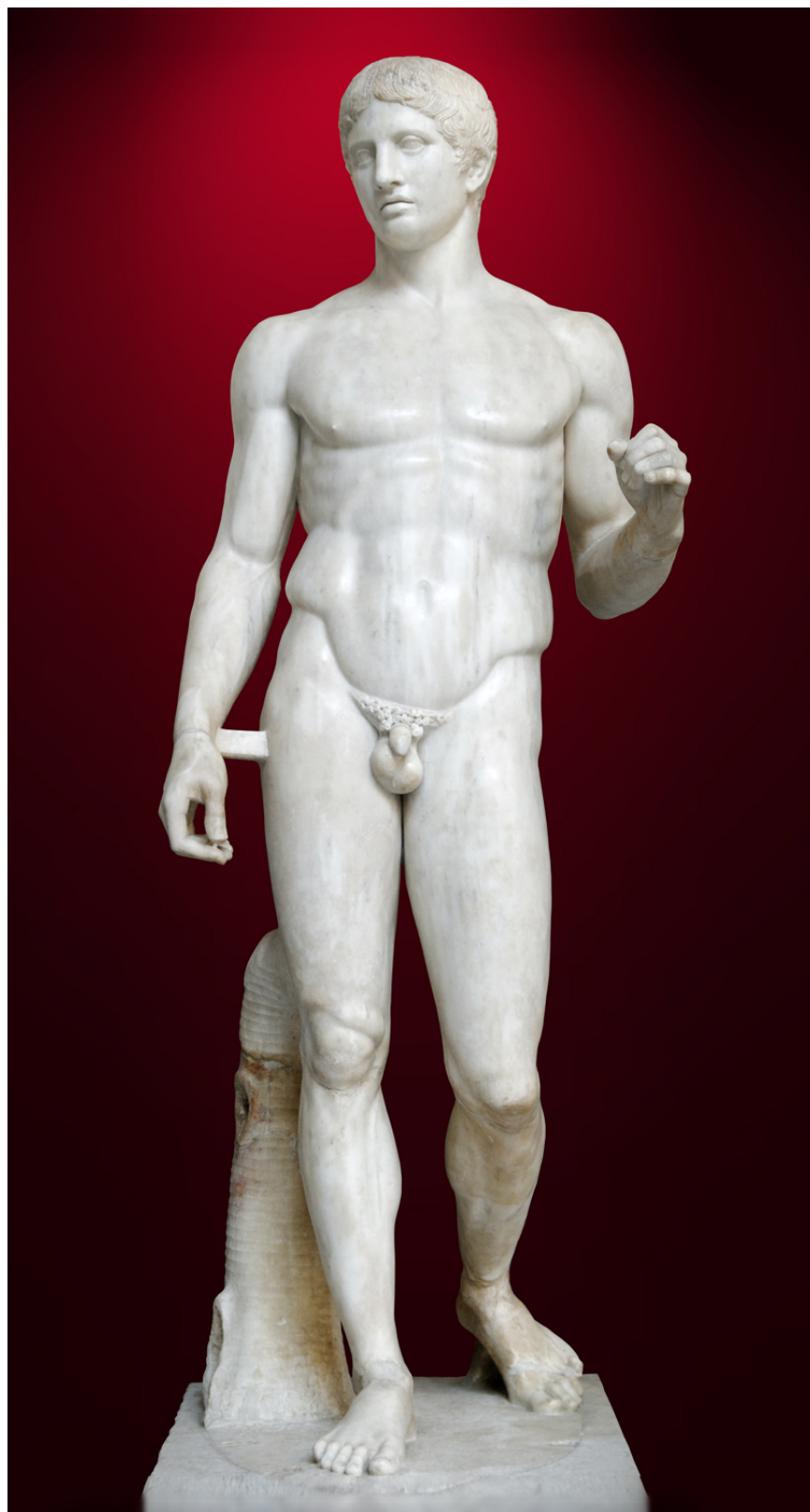
Figure 6. Polykleitos the Elder, Copy of Doryphoros from Pompeii , 1 st century BC — 1 st century AD