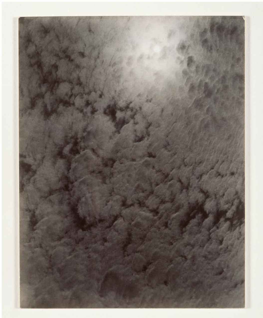
Figure 8. Alfred Stieglitz, Equivalent , 1926