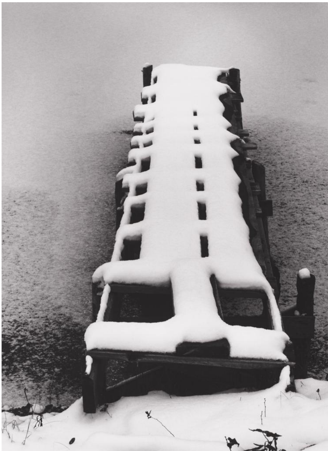
Figure 2. Minor White, Lincoln, Vermont , 1971