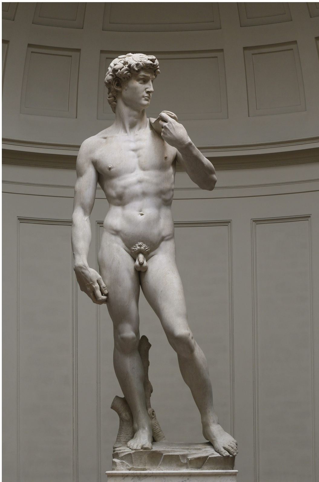
Figure 5. Michelangelo, David , 1501-1504